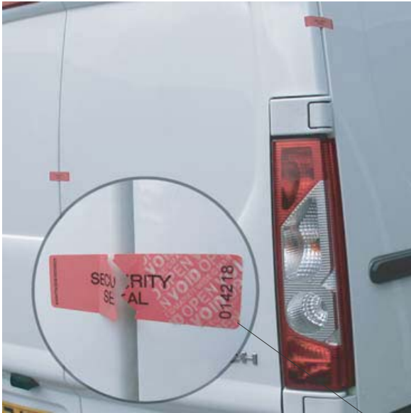
Highly visible tamper evident security message